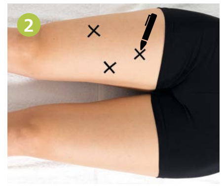
Mark the trigger points