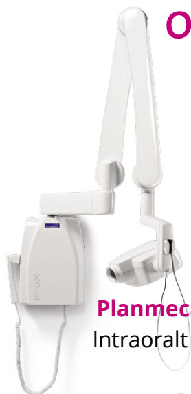
Planmeca ProX™ Intraoralt røntgen