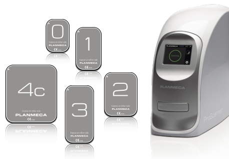
Planmeca ProScanner™ Fosforplade scanner