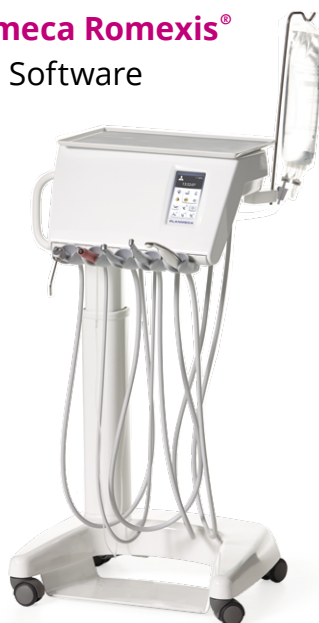
Planmeca Compact™ i Touch Dental unit