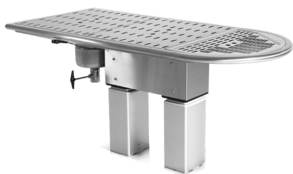
Planmeca Veterinær behandlingsleje