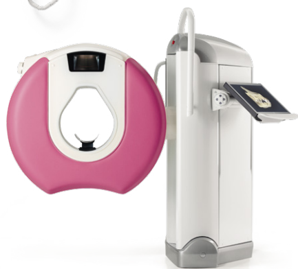
Planmed Verity® CBCT røntgen