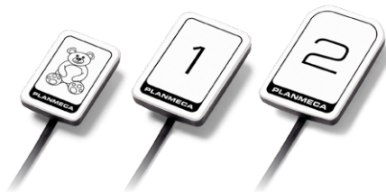
Planmeca ProSensor® Sensor system